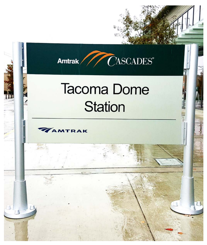
422 E 25th St., Tacoma, WA